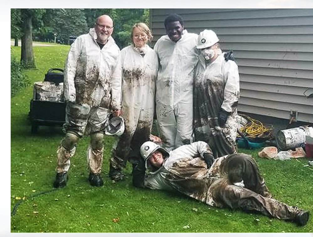
A crew of Habitat for Humanity workers take a break from flood cleanup.