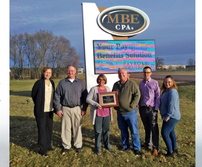
Pictured: MBE CPAs – our newest Community Foundation Partner. Thank you, MBE!

We launched our Community Foundation Partners campaign two years ago to build the fund to a $1 million endowment as part of our 25th anniversary celebration. Can you help us reach our goal? All gifts are welcome, and we invite local donors and businesses to become an official Community Foundation Partner with a gift of $25,000 or more. Your one-time gift will help us increase our annual Community Grants to $50,000 or more per year, available to all local nonprofits ... forever!